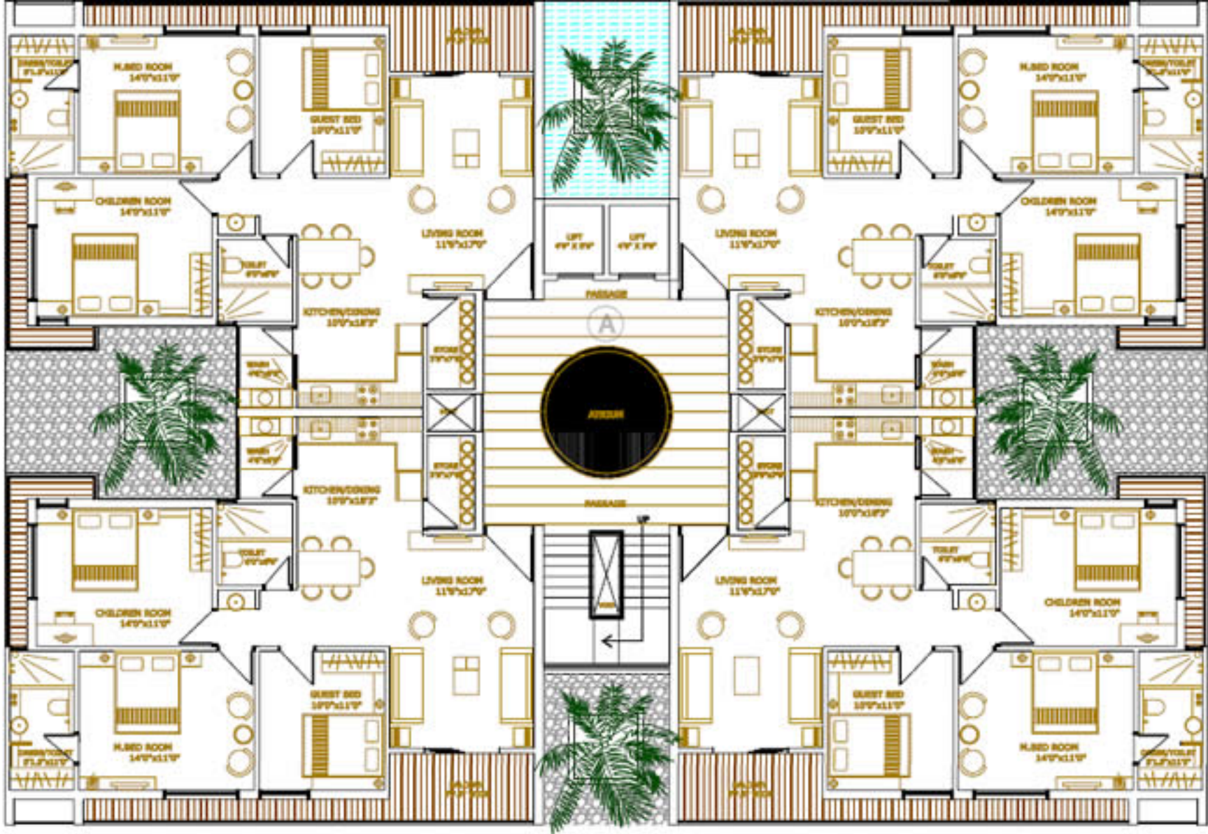
PROPOSED TYPICAL FLOOR PLAN FOR TOWER "A", SPRING'S RETREAT -2, VASNA-BHAILY ROAD, VADODARA.